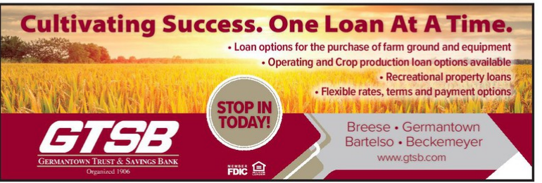
18 NEIGHBORS OF CLINTON COUNTY | January 2025